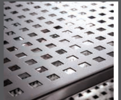
Adjustable perforated 304 grade stainless steel shelves