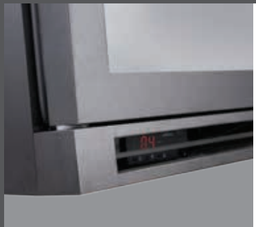
Style ventilation opening at the bottom (DBC models only)