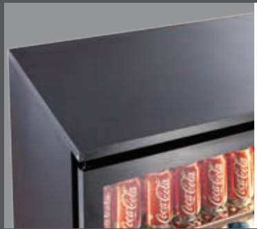
304 grade black no.4 finish stainless steel table top (DBC models only)