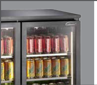
Anti-condensation double layers ultra-clear and toughened glass door with heated film