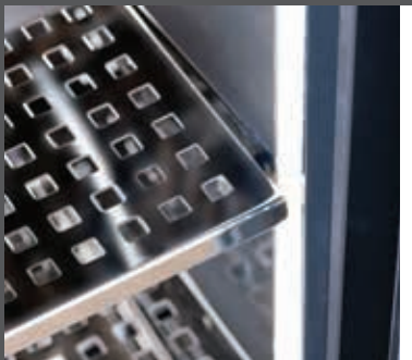
Bright, warm white (2700K) LED lighting with on / off switch