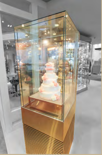
Superior standard model is available now, please contact us to obtain the spec.