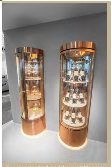
please contact us to obtain the spec.

Williams Refrigeration Hong Kong Ltd T: +852 2407 5422 | F: sales@williams-hongkong co