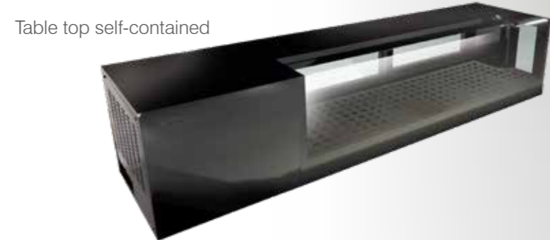
Table top self-contained